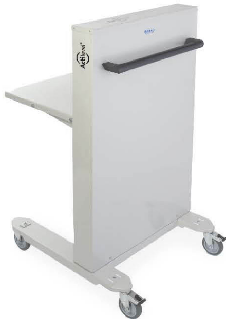
Actilevel Eco 85 / A Ref.: CL52B001 B

100% mechanical - no motor or batteries MAINTENANCE FREE