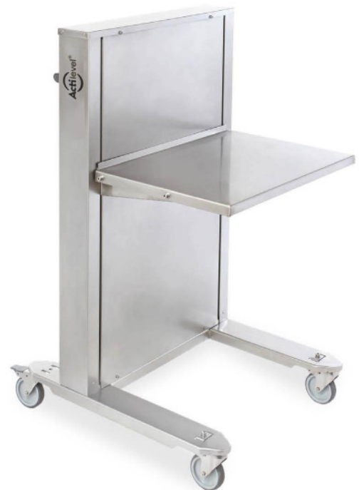
B : Actilevel® ECO 85/I