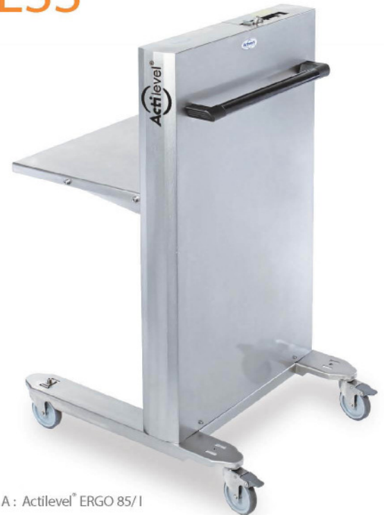
A : Actilevel® ERGO 85/I